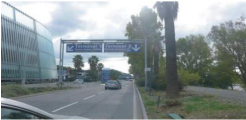
1 – Follow signs to Terminal 2.