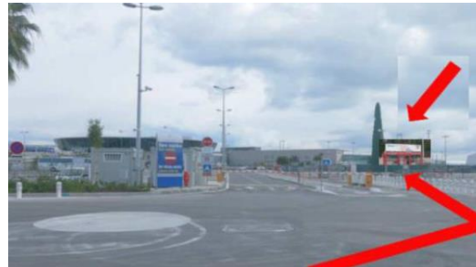
4 – Enter through an automated barrier arm, then look for the red TT Car office on the right.