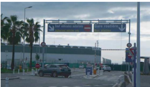
3 – Enter the restricted area "Gare Routière / Bus station".