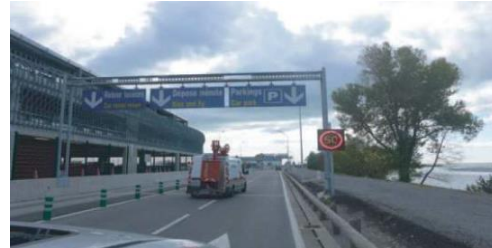
2 – Follow 'Parking' sign – keep right.